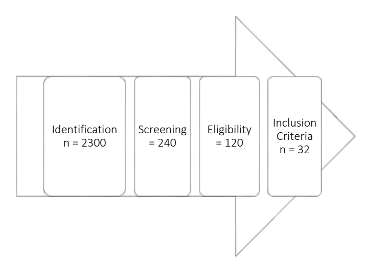
Figure 1. Research phase of this study

The research methodology is consisted of four main phases that is adapted PRISMA for reviewing scientific articles from Moher et al. in 2005 [7]–[9]. The flow of four phases of this study can be seen in Figure below.